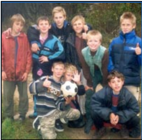
Orphans from Belskoye-Ustye during last year's summer camp.