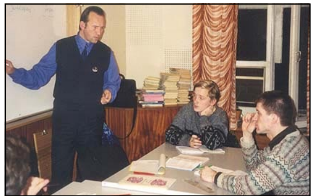
A class at the old Post-Orphanage Education Centre which has since been transplanted to Metro Sukarevskaya.

In the past, many of our post-orphanage students have seen ROST as just another free service to which they are entitled. Our hope is that the application process will also add prestige to the privilege of being able to study with ROOF, thereby encouraging students toward the final step of finishing high school and getting into a university, whilst preparing them far better for the responsibilities that go along with independent study. RT