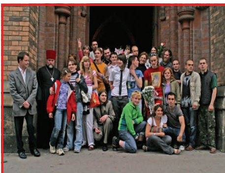
Students, teachers and staff of the EC at the entrance to the Anglican Church