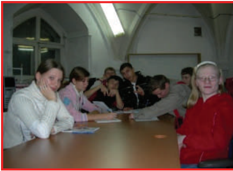
Group 7 before Maths lesson

Studies at ROOF's Education Center started on September 15, 2009. Besides the fact, that lessons were to start at 5 p.m. many students came to the Education Center about 2—3 p.m. While waiting for the lessons to start they were drinking tea, sharing their impressions about summer holidays, greeting the newcomers.