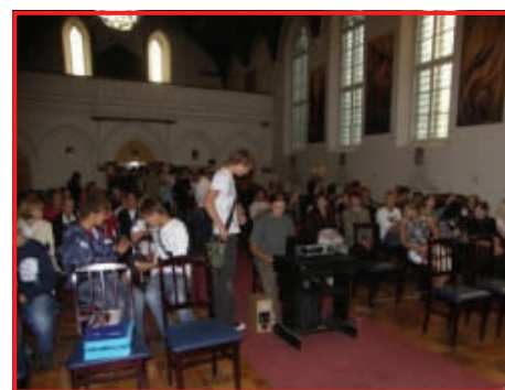
The EC students, teachers and guests at the party, dedicated to the opening of the new academic year

As per ROOF tradition, the ceremony was followed by tea and refreshments.