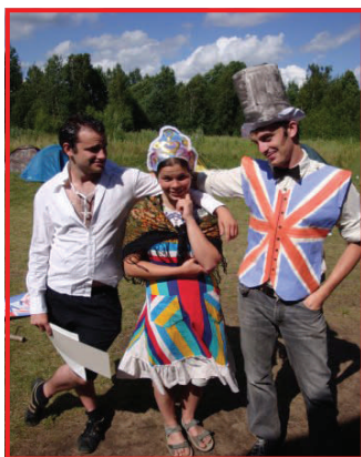
The Summer Camp

The tenth year in a row, the tiny village of Belskoe Ustye in Pskov Region completely transforms in July . At this time of year, besides the local inhabitants, one can see colorfully-dressed representatives of other nations, clowns, circus animals and a smorgasbord of fairy tale characters. It just so happens, that since 2000 ROOF has annually carried out a summer camp in the Belskoe Ustye Internat for the internat's little residents.