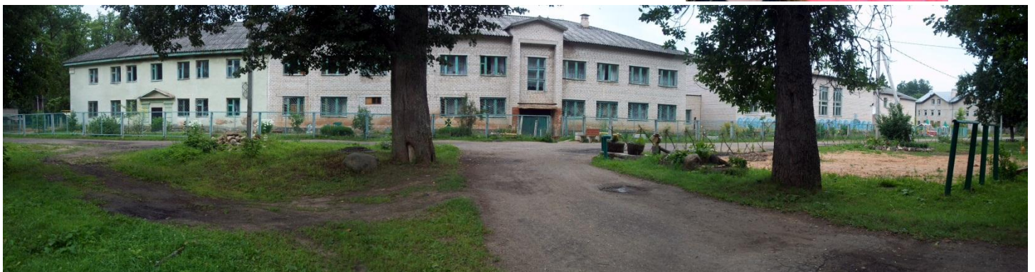
The orphanage at Belskoye-Ustye